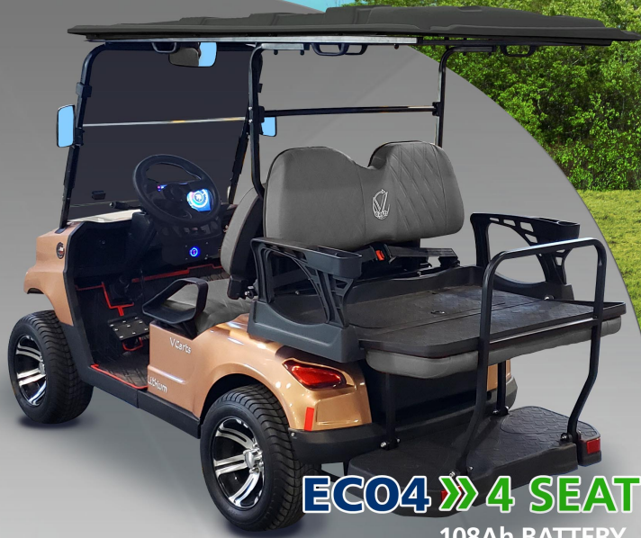
ECO4 » 4 SEAT 108Ah BATTERY