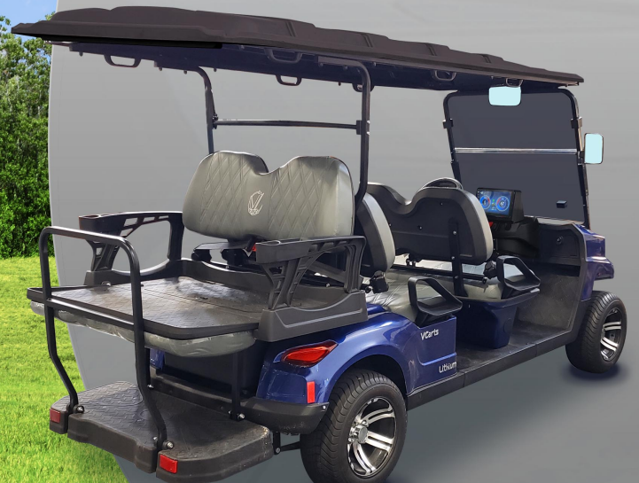
ECO6 » 6 SEAT 108Ah BATTERY