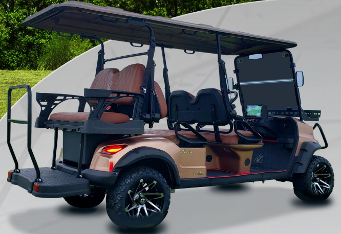
VC LIMO » 6 SEAT 186Ah BATTERY