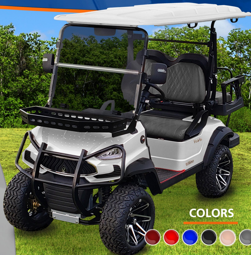
VC CRUISER » 4 SEAT 108Ah BATTERY