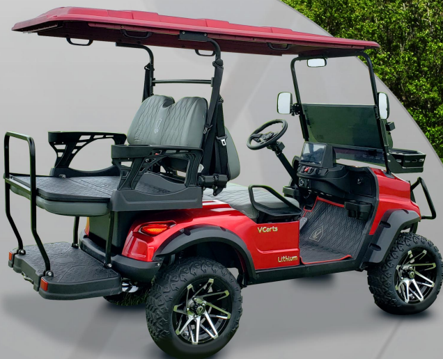
VC CRUISER » 4 SEAT 108Ah BATTERY